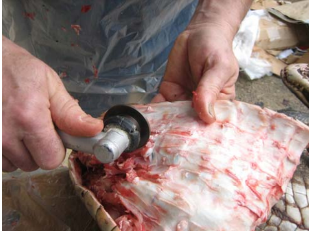
Stainless Steel Fleshing Blade